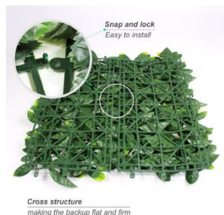
Premium Artificial Hedge & Vertical Garden Backing

Whether you choose our bespoke range or premium vertical gardens the backings allow for easy installation using a modular grid like system