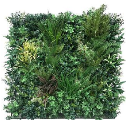
Bespoke Range Vertical Garden Foliage & Backing